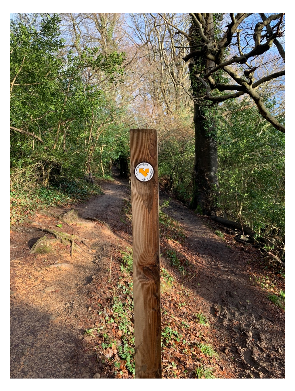
Video 1 – approach to this point <a href="https://youtu.be/VOaxRRJMSHU">https://youtu.be/VOaxRRJMSHU</a>